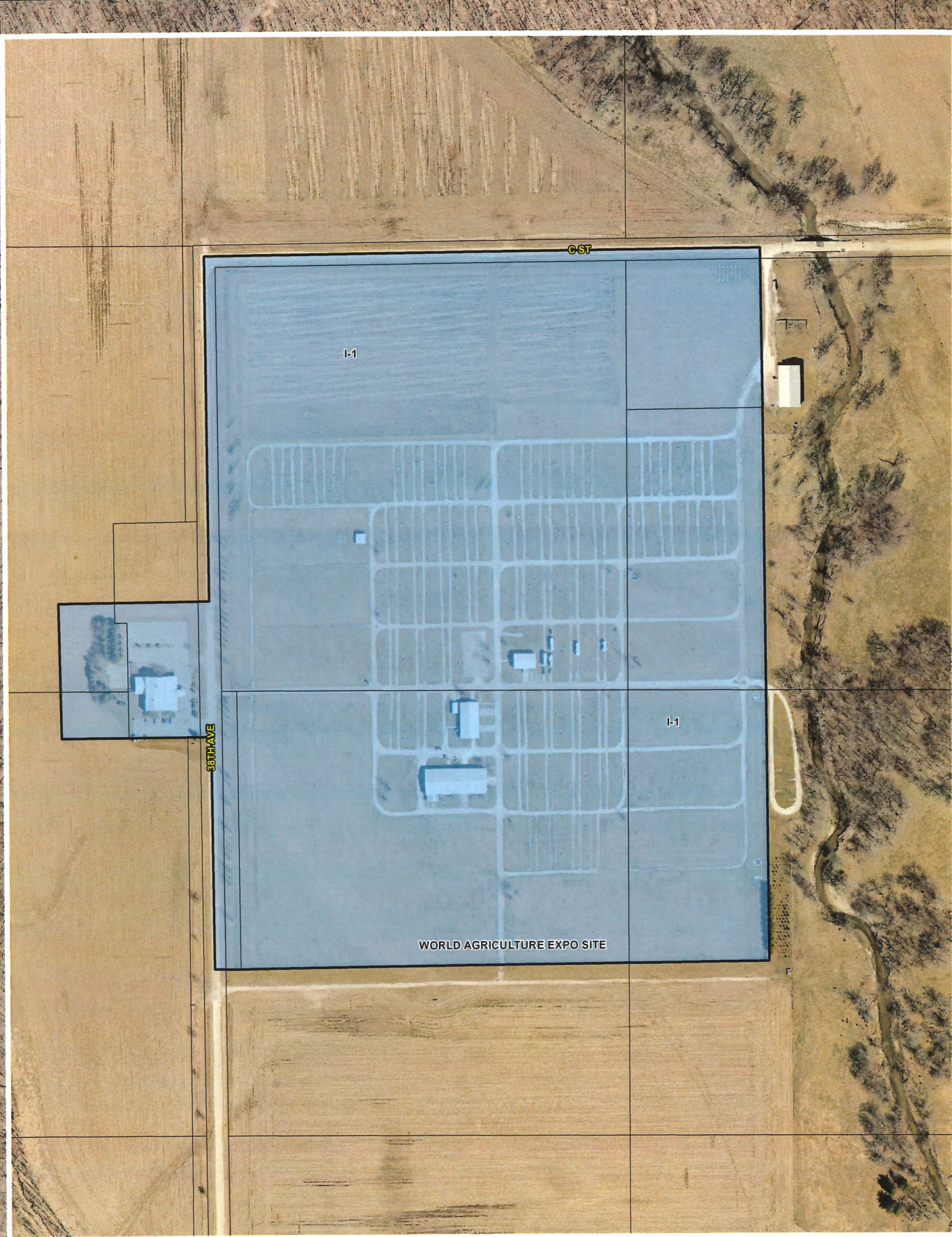
ZONING MAP AMANA COLONIES LAND USE DISTRICT